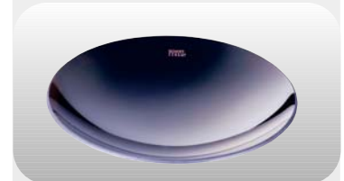
High-quality ceran bowl for optimal heat distribution.