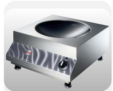
Wok-Line, fully in the trend for front-cooking. International cuisine at no extra cost.