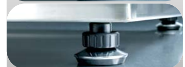
Height-adjustable, lockable feet.