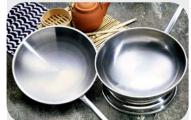
Two woks in different sizes. Left: hemispherical wok with 5.2 litres capacity, next to it a spherical wok of 9.5 litres capacity.